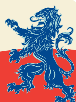
Photo credits: @Tristian Deschamps / Only Lyon Tourisme & Congrès, @Jakob + MacFarlane Architectes, @Quentin Lafont/Concepteur - Coop Himmelblau.

Centre de Congrès de Lyon 50 Quai Charles de Gaulle 69463 Lyon Cedex 06 Tel +33 (0)4 72 82 26 26 Web www.ccc-lyon.com